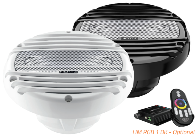
HM RGB 1 BK - Optional